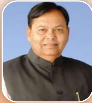
Hon. Dr. Patangrao Kadam.